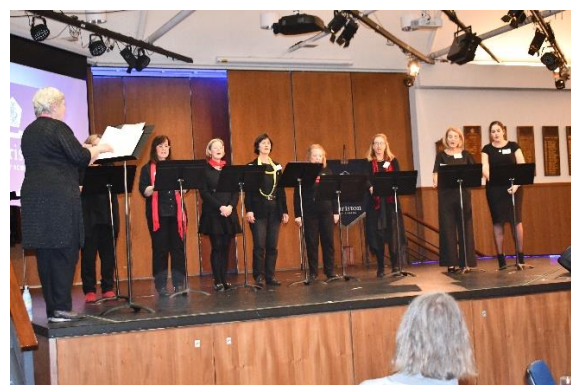
The Huntingtower Singers